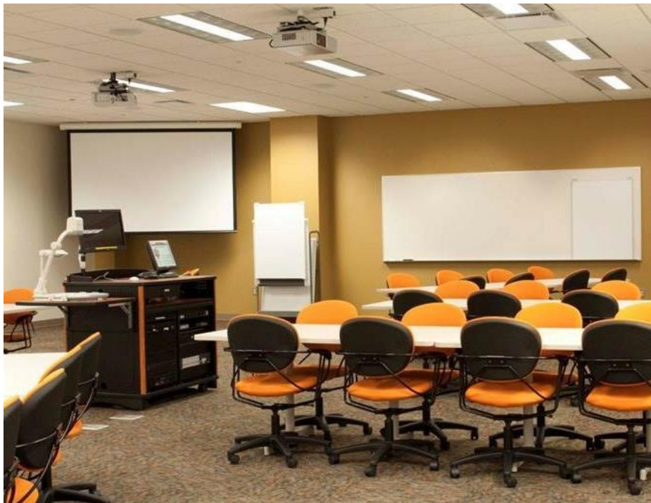
Figure 4. Image of active learning classroom Cedar Hall 002.

Cedar Hall 002 has seven, eight-person tables and sixty chairs for group collaboration. Students have access to multiple whiteboards on the walls and Huddleboards for collaborative work. Cedar Hall 002 has three projection screens and a Copycam (whiteboard camera), as well as an interactive whiteboard that enables the capture of instructional materials produced in the classroom by both the professor and the students.