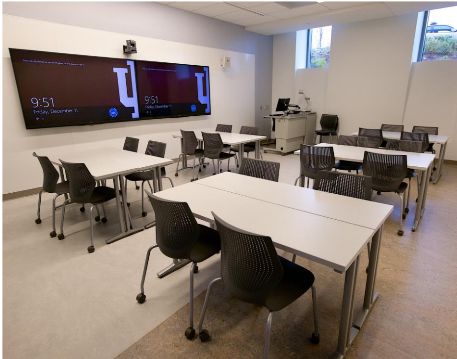
Figure 3. Image of active learning classroom GA 0009.

GA 0009 is located in Indiana University-Bloomington's new Global and International Studies building. GA 0009 has ten tables and twenty-two wheeled chairs to allow for multiple configurations. Three of the four walls are whiteboard walls for student collaboration. The instructor station has a Crestron display with a document camera. On one wall, GA 0009 has two 80" flat panel displays. The room also has an HD video camera for lecture capture and PC-based video conferencing and collaborative technologies.